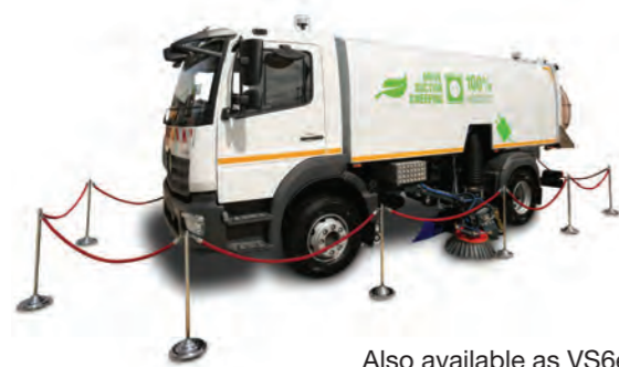
Also available as VS6e.