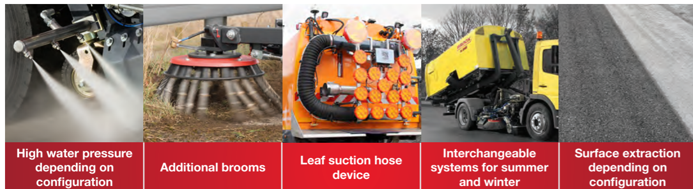
High water pressure depending on configuration

Thanks to our modular system, your machine becomes an unbeatable cleaning professional. Here you will find a small selection of possibilities: