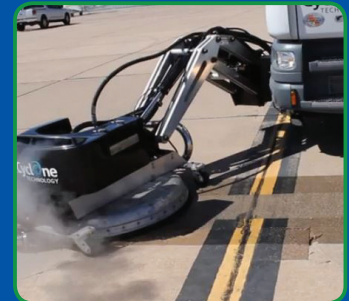
Single pass paint removal leaves surfaces clean and dry within minutes.