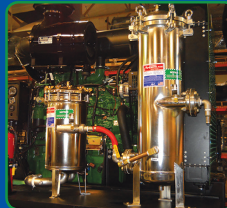
Organic material and particles filtered from fresh water to ensure high quality inlet water for the UHP pump.