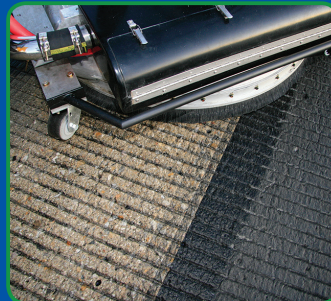
Cleans into the grooves of a runway for increased friction and drainage.